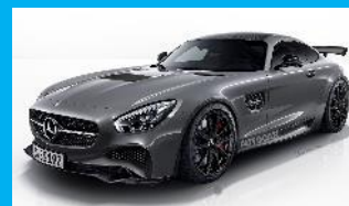
Composite WSS (C190 – AMG GT)