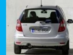
Komplexe ESG-Heckscheibe (W169 A-Klasse)