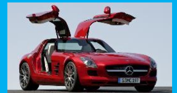
Komplexgebogene WSS (BR 197 SLS-AMG)