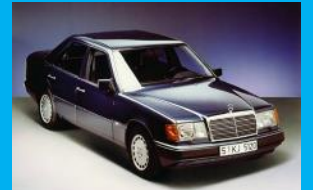
WSS mit Siebdruck (W 124 E-Klasse)