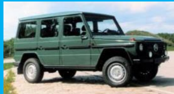
Drahtbeheizte WS (W460 – 463 G-Modell)