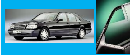
Isolierglas Seitenscheiben (W140 S-Klasse)