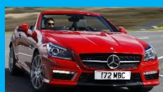
WOP-Antennen (R172 - SLK)