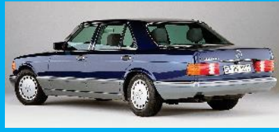
Drahtbeheizte VSG-Heckscheiben (W126 S-Klasse)