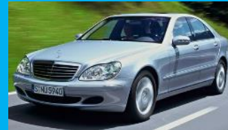
VSG-Seitenscheiben (W 220 S-Klasse)