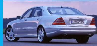
Antennen in IR-Verglasung (W 220 S-Klasse)