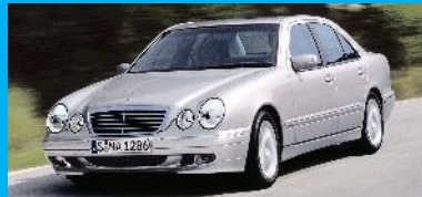
Pressgebogene WSS (W 210 E-Klasse)