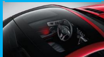
Magic-Sky-Control Rooflight (R172 / R231)