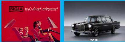
Erste VSG-Scheiben aus Witten